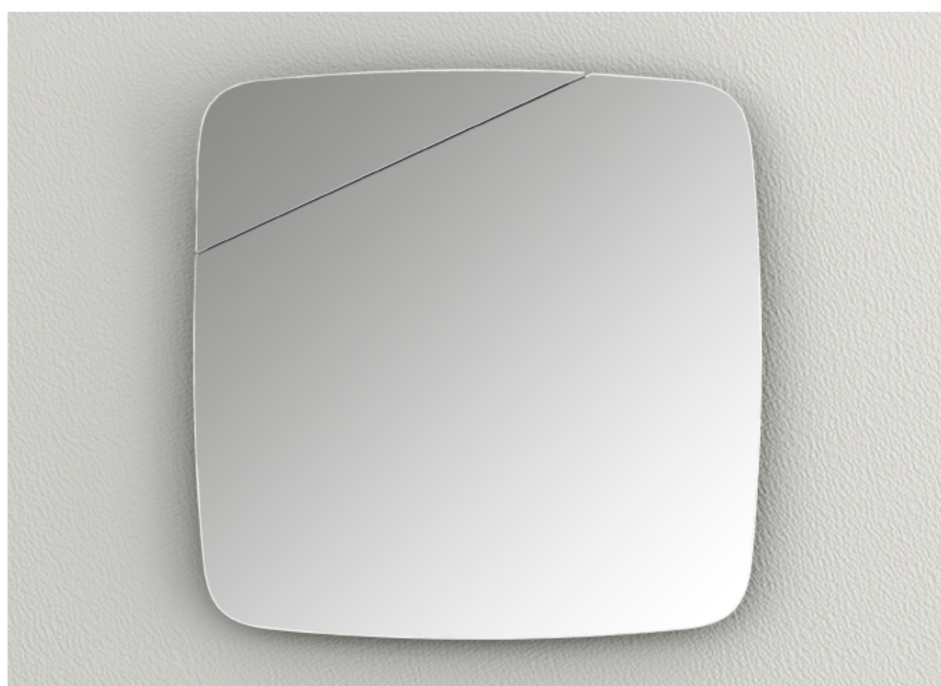
■ Y016001XAC (draft Image)