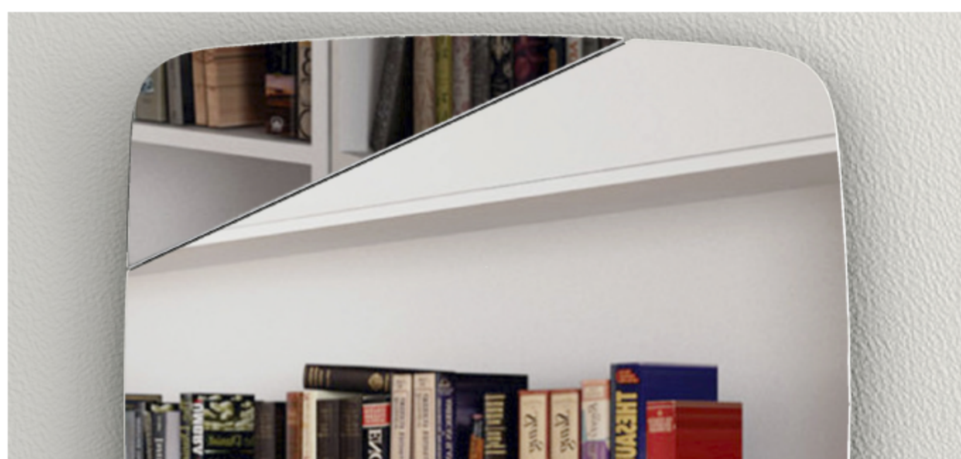
■ Detail (draft Image)